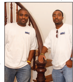
NBC New Baltimore Contractors, LLC

Most impressively, both men served on a committee to build a playground in the community. Their hard work and dedication demonstrated leadership ability and sparked their desire to establish a construction and contracting company designed to bring employment opportunities to the community. On April 30, 2009, they launched New Baltimore Contractors LLC and officially started rehabbing their first property that is a part of the Gateway Development. This company, Druid Heights CDC and State Farm Bank have taken a bold step of investing in a development that will bring revenue and new jobs to the community. To date, NBC has completed one moderate rehab, one total rehab and are currently completing another total rehab to a residential property.