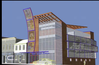
Druid Hill Lake Park