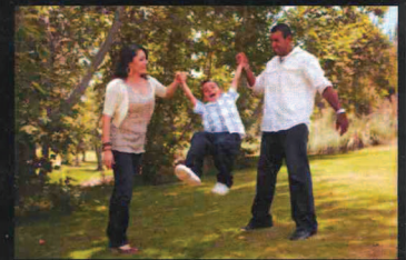
5 minutes from MARC Train